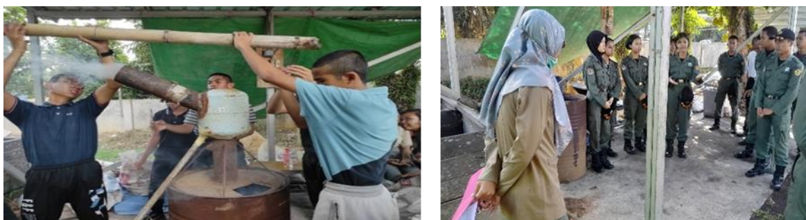
Figure 3. Implementation of the Guidebook