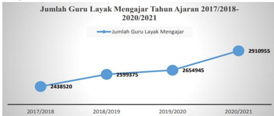
Figure 1. Data on the Increase in the Number of Teachers in Indonesia

education, which causes teachers to be unable to improve their skills. In addition, the presence of the Education Expansion Policy (BPI) is a big challenge for policymakers (the government) in improving the quality of teachers and education personnel (Oktaviani & Aliyyah, 2022).