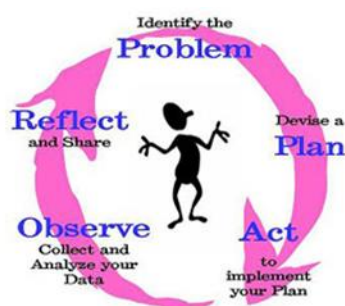
Figure 2. Design School Action Research

The number of research subjects was 10 teachers. The object of research was the teachers' ability to apply the PAIKEM learning model (Arisandi, 2019). This research is successful if the average value of the teacher's ability to use the PAIKEM learning model reaches a minimum of 80 and at least 80% of the subjects can use the PAIKEM learning model. The score categories are determined as follows: Scores 90-100 (very good), 80-89 (good), 70-79 (enough), 60-69 (poor), and 60 and below (very poor) (Aslam et al., 2021).